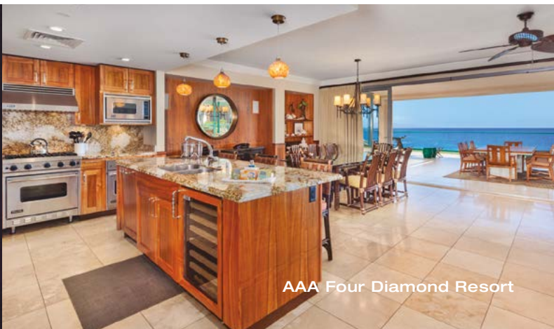
AAA Four Diamond Resort

Book One Of Our Suites And Receive A $1,000 Resort Credit + Free Mid Size Car Rental