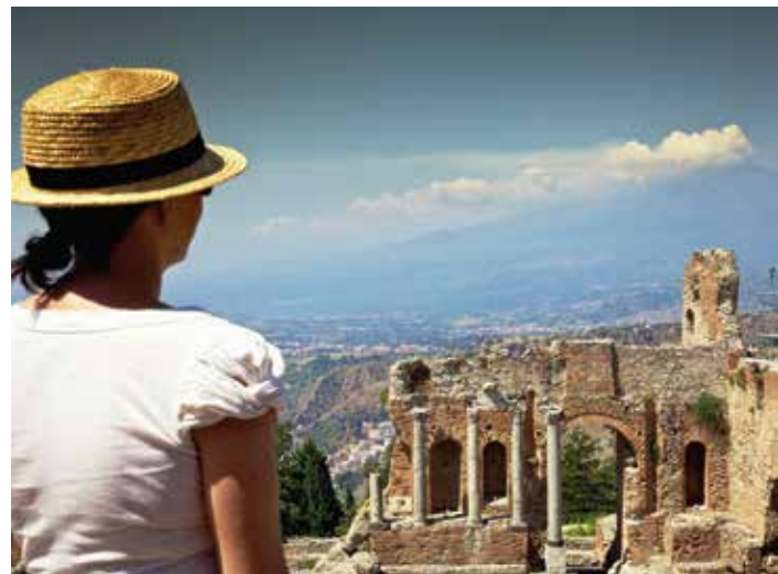
↑ Taormina's Greek amphitheater.