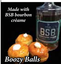
Made with BSB bourbon crème

Lake Tapps | Tacoma | Covington | Federal Way | Puyallup | Orting | Issaquah