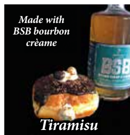
Made with BSB bourbon crème