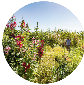
The Mission Garden project recreates the orchards and farmsteads that have fed Tucsonans for millennia.

Chefs, growers, food artisans—all embrace what's known as 'borderlands' food, combining the indigenous, Hispanic, and American heritage of the area.