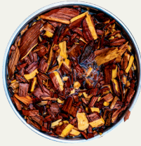
Mesquite wood chips.

Ground from the seed pods of the quintessential desert hardwood, mesquite flour lends a nut-like, mellow depth to foods. It's largely an additive. You can find it in everything from pizza dough and bread to lattes to cookies.