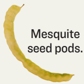
Mesquite seed pods.

Mesquite wood is also highly sought for fine, dark, durable furniture—and it's the fuel of choice for barbecue and grilling from West Texas to Arizona.