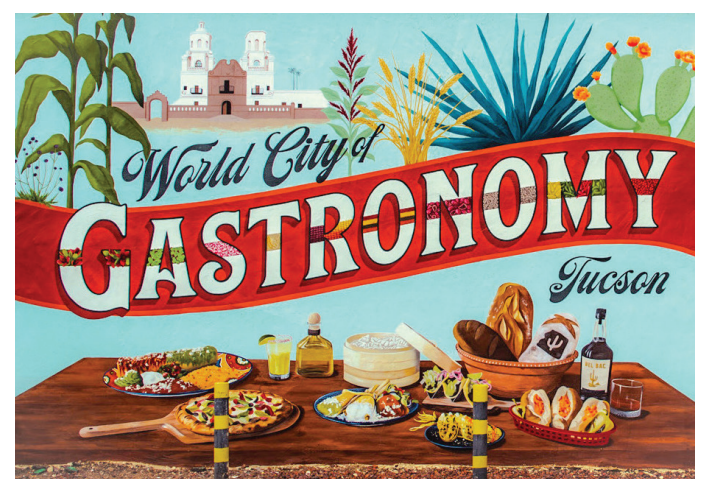
A mural outside Zio Peppe celebrates Tucson's UNESCO designation.