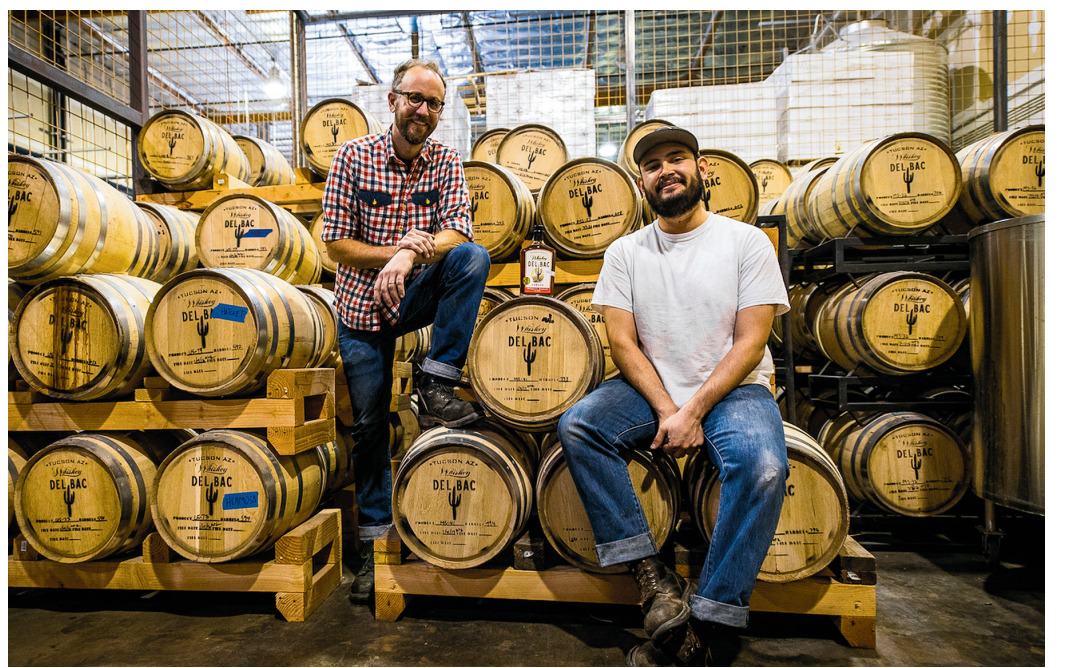
Local distiller Whiskey del Bac uses mesquite fire to smoke the barley for its Dorado and Old Pueblo products—genuine smoky single-malts.