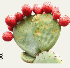
Prickly pear cactus.

Anyone who's ever visited the Southwest has seen these iconic cacti, their ping-pong paddle arms branching like candelabras and sporting, in fall and winter, conical fruits that are a fierce fuchsia color, as vivid as a desert sunset. The juice of these fruits—called tunas in Spanish—is widely used in jellies, bar drinks, candies, marinades, gelato, sorbets, and more.