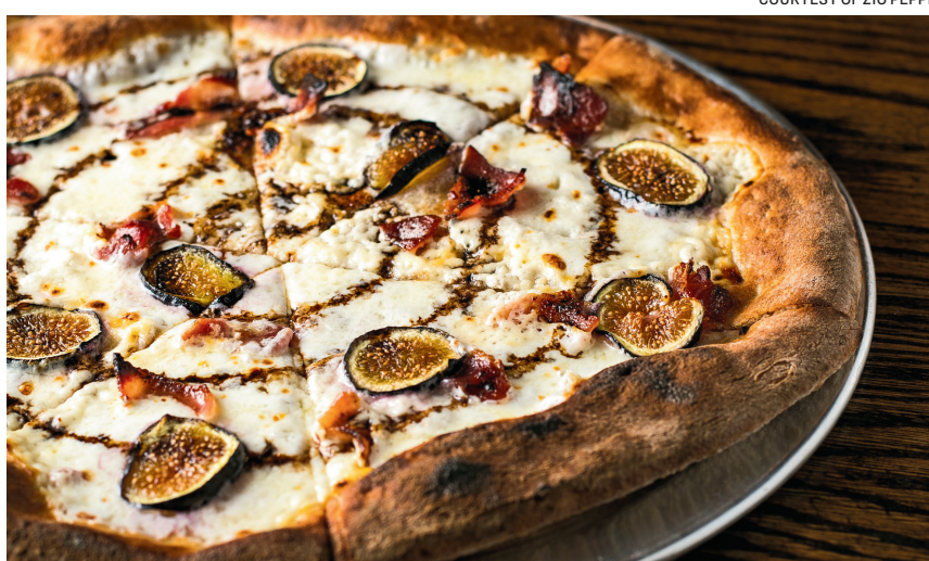
Locally harvested and ground mesquite flour lends a nutty depth to Figgy Stardust pizza at Zio Peppe. The pie is topped with honeyed cheese embellished with dried figs and pomegranate concentrate.