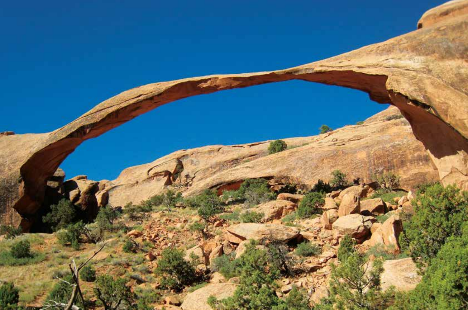
At left: A panoramic view of Death Valley's Badwater Basin in California—the lowest spot in North America. Above: The 306-foot-long Landscape Arch in Arches National Park in Utah. Right: Mount McKinley, the highest mountain peak in North America, is an awe-inspiring attraction for those visiting Denali National Park in Alaska.