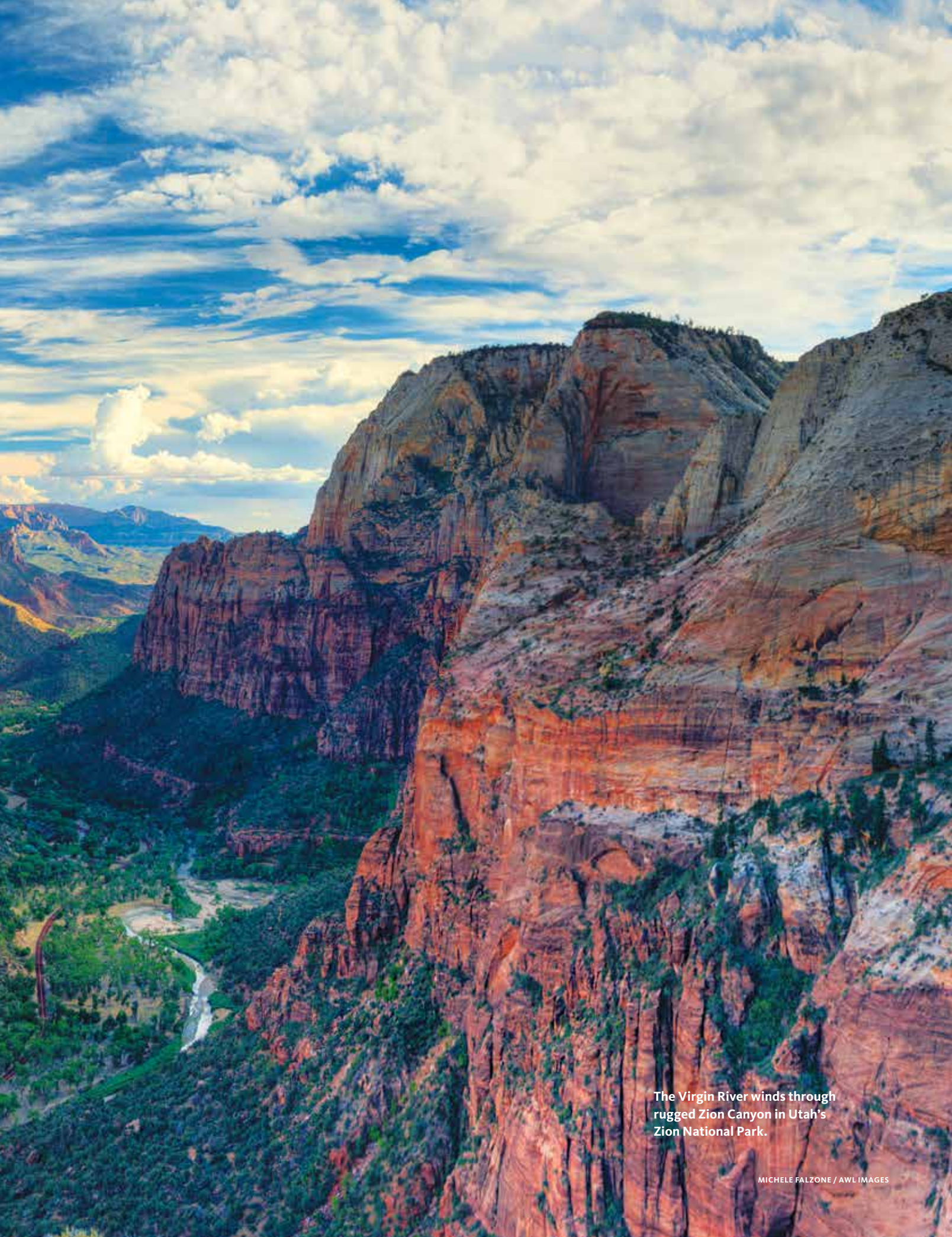
The Virgin River winds through rugged Zion Canyon in Utah's Zion National Park.