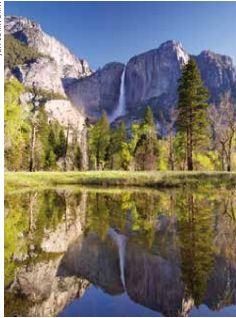
Yosemite National Park in California has inspired generations with its beauty and grandeur.

As in Glacier Bay National Park and Preserve, Grand Canyon National Park, Yosemite, Zion and so many more—Twain’s declaration remains true today. Drive the full length of Chain of Craters Road in Hawai’i Volcanoes National Park and you eventually arrive at the Pacific shoreline, which is famously growing as a consequence of Kilauea’s lava flows.