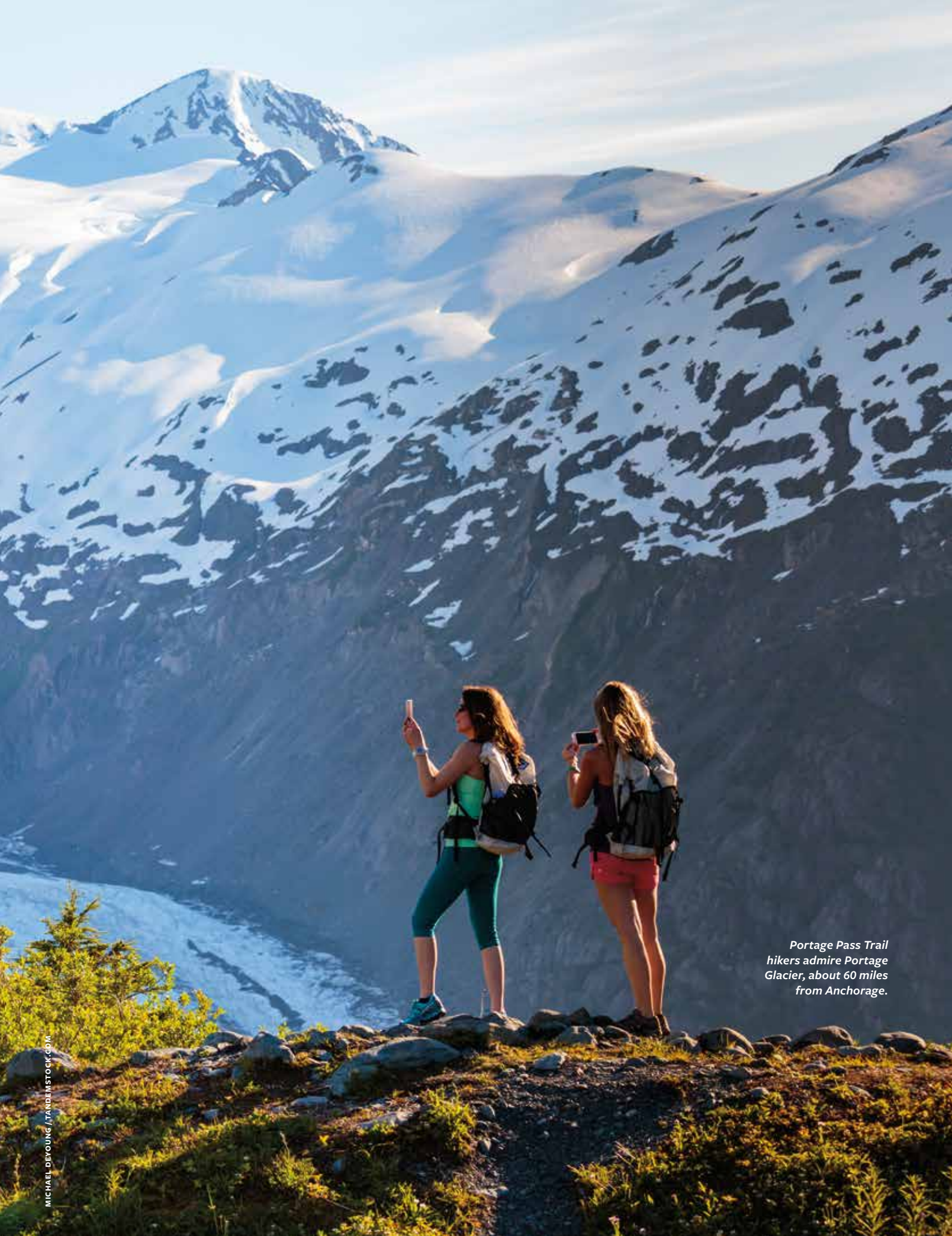
Portage Pass Trail hikers admire Portage Glacier, about 60 miles from Anchorage.