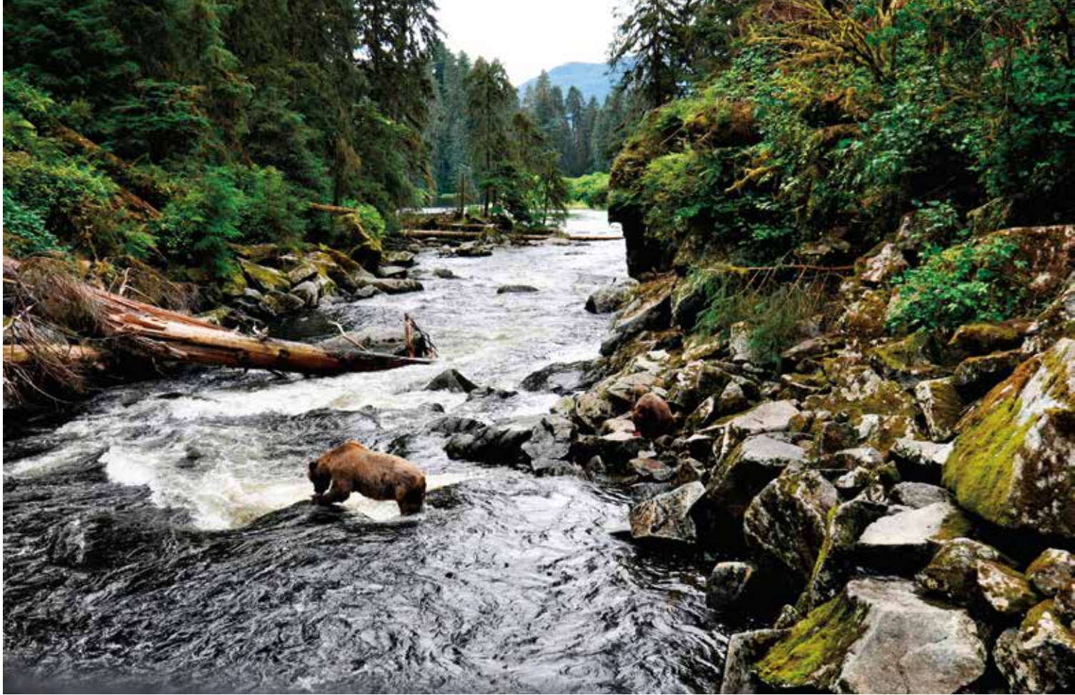
Brown bears fish for salmon near the U.S. Forest Service's Anan Creek Wildlife Viewing Site.

than plush. But this interlude along the Denali Highway epitomizes Alaska's unexpected pleasures and how easy they are to find: moments that are memorably intimate, warm and low-key. We'd left Fairbanks to go for a two-day exploration along the Denali Highway, and the journey's small-scale delights were buttressed by the usual magnificent sights: ivory pinnacles on the horizon—including Denali, North America's tallest mountain—eagles and caribou by the road, the vast distances bracketed by hillsides of fuchsia fireweed.