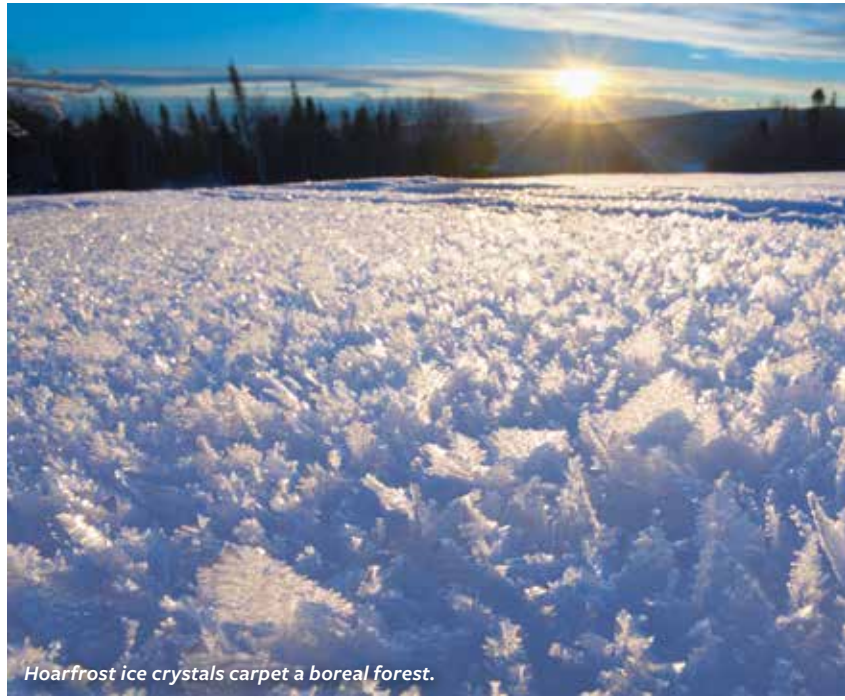
Hoarfrost ice crystals carpet a boreal forest.

Deep cold has settled on Ambler—an Inupiaq village in northwest Alaska. In this remote communi-