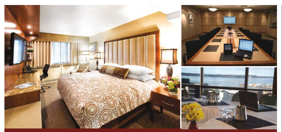
FAIRBANKS • ANCHORAGE • WHITEHORSE • JUNEAU • DAWSON CITY • DENALI • SKAGWAY • SITKA