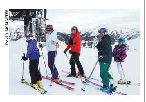
Downhill skiers enjoy the Eaglecrest Ski Area, near Juneau.

rod, show you how to jig it gently in the aquamarine water, and clean your catch.