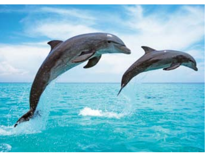
Opposite: A diver in the Sea of Cortés swims among colorful tropical fish. Above: Bottlenose dolphins leap out of the sea once referred to by Jacques Cousteau as "the world's aquarium."

itself again. I spot a huge barrel cactus, easily 12 feet tall and almost 3 feet in diameter, with flexible spines.